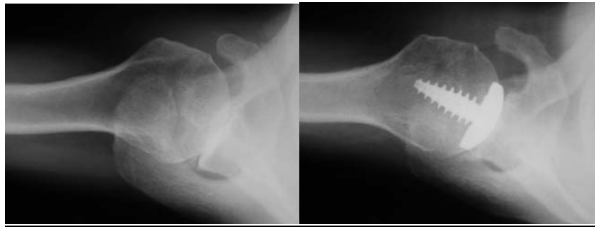
Pre-op showing “bone-on-bone” Post-op HemiCAP in place

Resurfacing is a very effective procedure to treat arthritis of the shoulder (Glenohumeral Joint). The HemiCAP inlay resurfacing arthroplasty device for the shoulder is an anatomical way to restore smooth motion to the joint, improving function and diminishing pain. The device itself is an inlay, rather than an onlay, which is intrinsically more stable and may well prove to be more long lasting. With this operation there is minimal bone removed, so bleeding is kept to a minimum, and future treatment options are maintained. The procedure is appropriate for those patients with lost cartilage on the surface of the joint. Most patients undergoing this surgery suffer from pain in the joint, aching, grinding and limited motion. This surgical technique is performed using minimally invasive surgery, and can be performed together with repair of tendons, removal of bone spurs or other necessities at the time of the surgery. Most patients have this surgery as an outpatient and are able to return to activities in a matter of weeks.